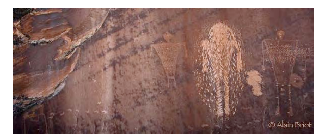
Desecration Panel, San Juan River