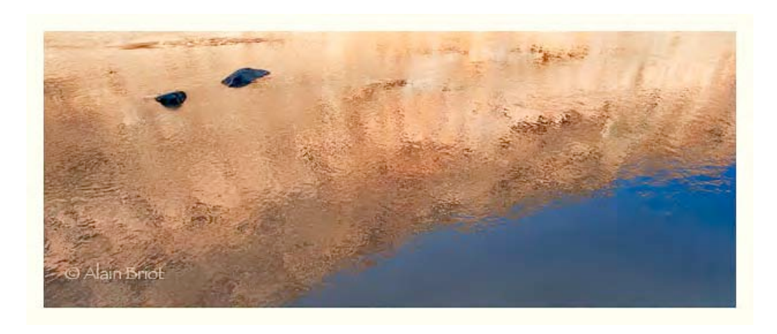
Reflections, San Juan River

The re-chipped cartridge is installed in the light light black slot using an ink purge process not unlike the "African ink change" that I described in my Epson 9600 diary two years ago. With this process, the black ink is purged out of the ink lines by printing with the light light black only until the light light black is fully drained and the matte black has replaced it. A printing file (called the purge file) that uses only light light black is provided by Colorbyte together with a detailed description of this procedure. The process takes less than 15 minutes and only involves draining the light light black ink line. The other ink lines are left untouched, unlike the regular Epson ink-change process, thus minimizing the loss of ink and money. The light light black cart can be saved, if still partially filled, and re-used, if you are so inclined.